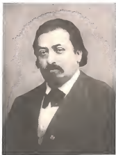
Henry Wieniawski, whose brilliant concert pieces contain many sparkling staccato passages.

Investigation of the church records of the town discloses that "the first musical instrument used here in public worship was a bass viol, which was introduced in 1795 and which continued to be used until within the memory of many here today." (Massachusetts, 1898) Further research on the subject reveals that instruments of this type ("mistakenly called bass viola, for they were violoncellos) were the cause of such violent controversy among ministers, deacons and the more sanctimonious church members of our great grandfathers' day that many stayed away from divine service in open rebellion. A venerable deacon of Roxbury not only left the church at the first note of the hated viol, but also gave vent to his feelings by setting up a frightful crierwalling outside. At the First Baptist Church at Providence, a pious sister, incensed at the twanging of the strings, founced out. (Continued on Page 344)